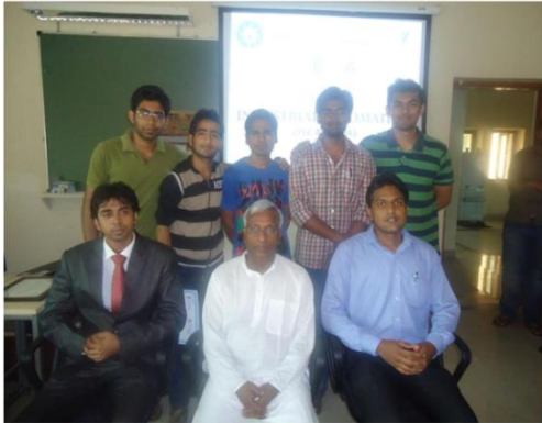
Winners team of the competition along with the Director and Trainers