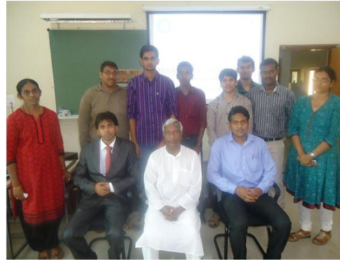
Faculty and Student Coordinators of the workshop along with Director