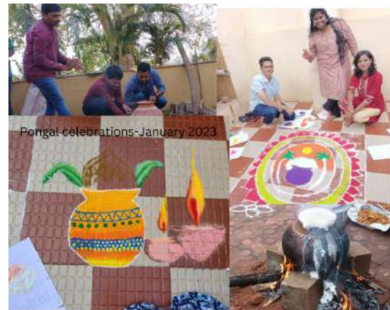
2. Pongal Celebrations