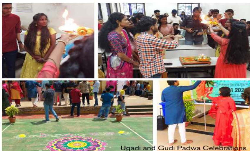
3. Marking the 'Navya' celebration