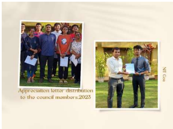
1. Appreciation letter for students

The club has conducted various events during the academic year 2022-2023. Initially, we did the celebration of Pongal in January 2023, and we received a grant participation from students. Further, we conducted Navya 2023 on March 22 2023 - an event celebrating Gudi Padwa and Ugadi, which marks the new year for Konkani and Telugu Region. Students from across the region performed Puja during the event and engaged in various cultural and entertainment events. As a part of the 'Har Ghar Tiranga' campaign (August 13-15, 2023), the EBSB club of NIT Goa organizes various competitions for students. These include Kaavyarath, Rag and Prasthaav.